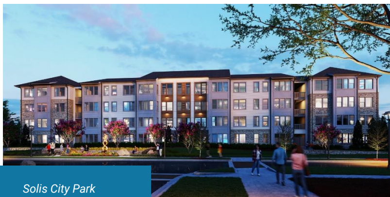
Solis City Park Charlotte, NC