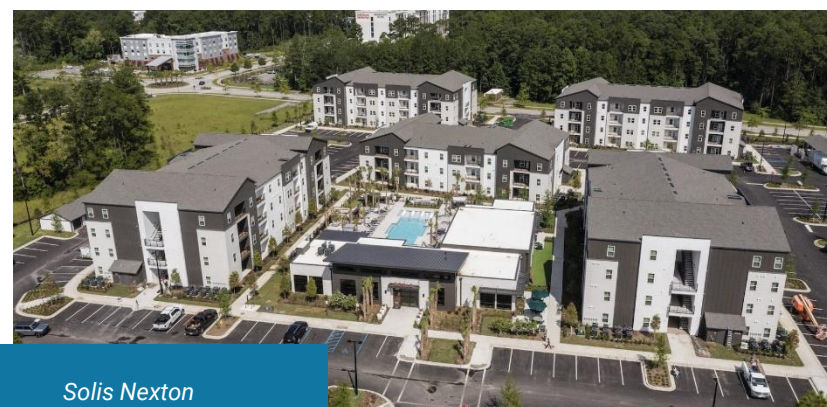
Solis Nexton Summerville, SC