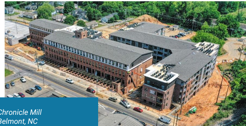
Chronicle Mill Belmont, NC