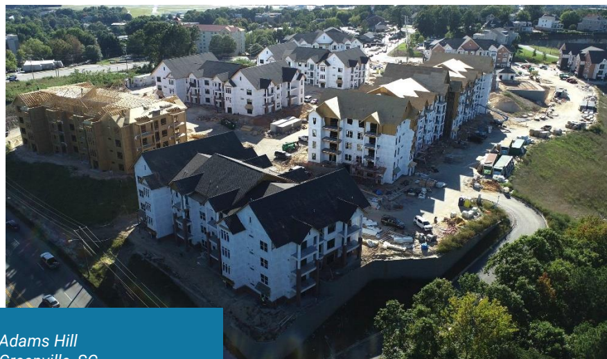
Adams Hill Greenville, SC